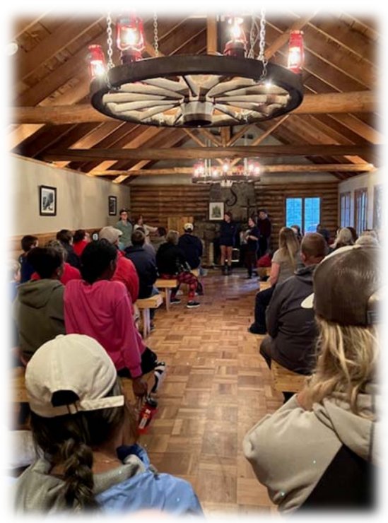
Video - You Are My King/Amazing Love: https://youtu.be/yslBh95opc0

In tonight's song we see His love is never ending and always there. <u>Don't be afraid to belong to</u> <u>God! God is like Scotch Tape.</u> <u>You can't see Him, but you know</u> He is there.