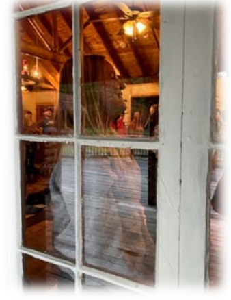
Thanks and LET HIM LIGHT YOUR PATH!