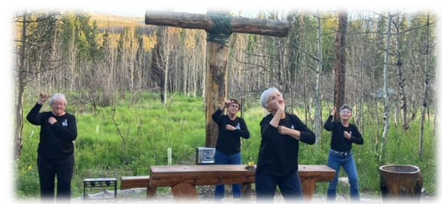
Video - <u>We All Bow Down</u> https://youtu.be/MKzzO-Rxe1k

<u>Sunday - July 2, 2023</u> - At the worship Service we signed " We All Bow Down. " We introduced our songs with the theme "God is like.....Don't Be Afraid to Belong to God."